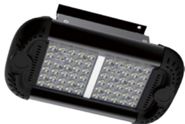
90 W Black and silver