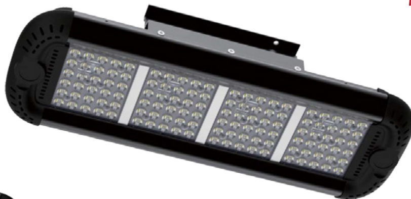
150 W Black and silver